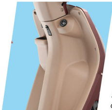
NEW SILVER OAK PANELS

Ensure more comfort for your pillion as you ride with a thoughtfully designed pillion back rest