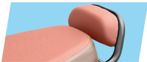
PREMIUM SEAT WITH PILLION BACK REST

TVS Jupiter ZX SmartXonnect is loaded with novel features that are aesthetic in appeal and advanced in technology. The dynamic design is thoroughly thought through to deliver a riding experience unlike any other.