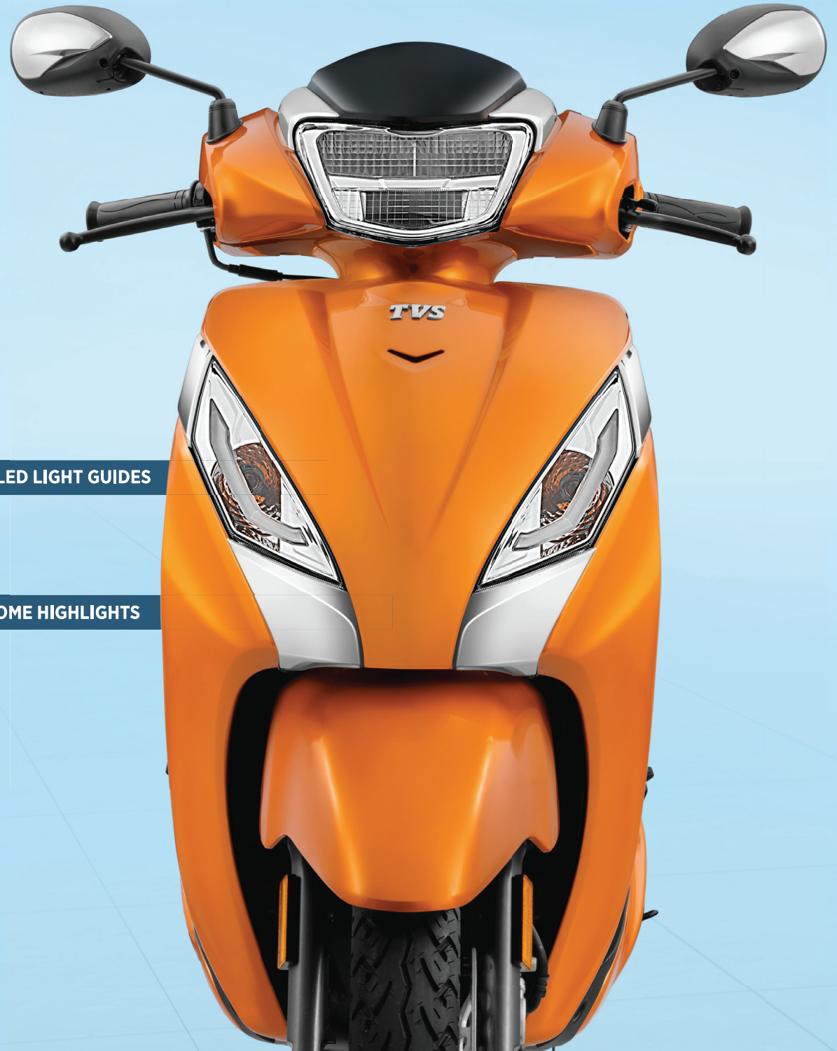
SIGNATURE LED LIGHT GUIDES