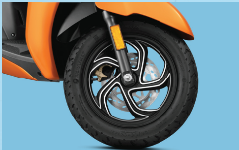
DIAMOND-CUT ALLOY WHEELS