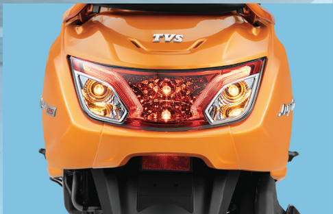
ELEGANT TAIL LAMP