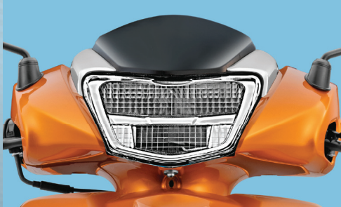
STYLISH LED HEADLAMP WITH VISOR